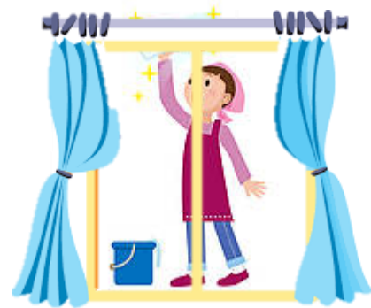
6. cleaning the windows