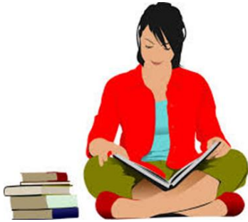
1. reading a magazine