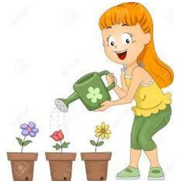
3. watering the plants