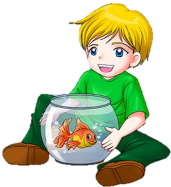
4. feeding the fish