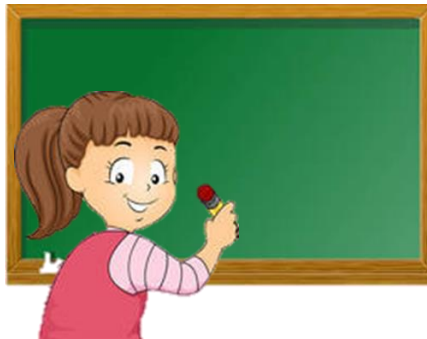
5. writing on the board