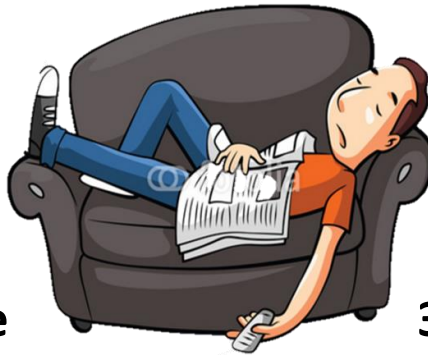
2. sleeping on the couch