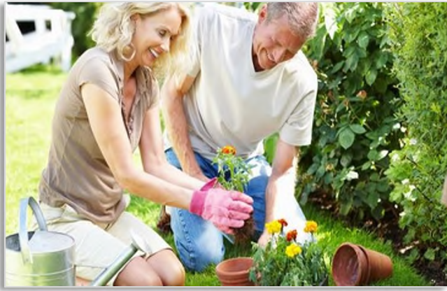
3. Are your parents busy? planting / flowers