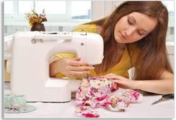
4. Are you busy? sewing / blouse