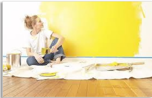
5. Are you busy? painting / room