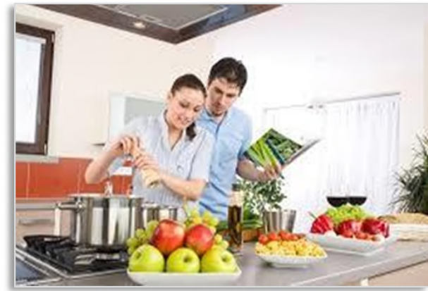
6. Are you and your husband busy? cooking / dinner