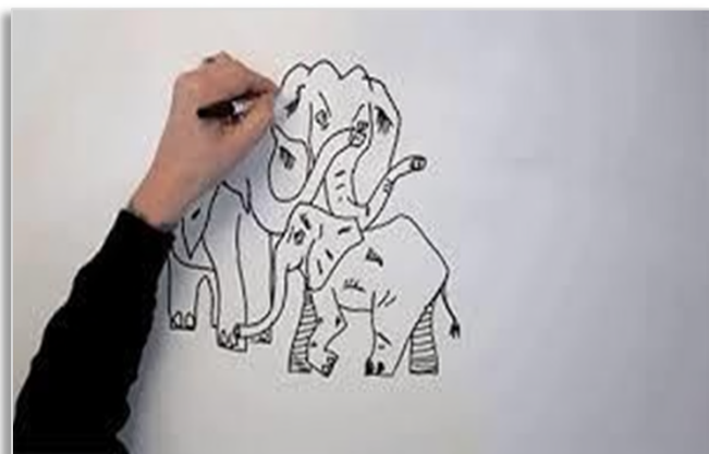
7. Is Peter busy? drawing / animals